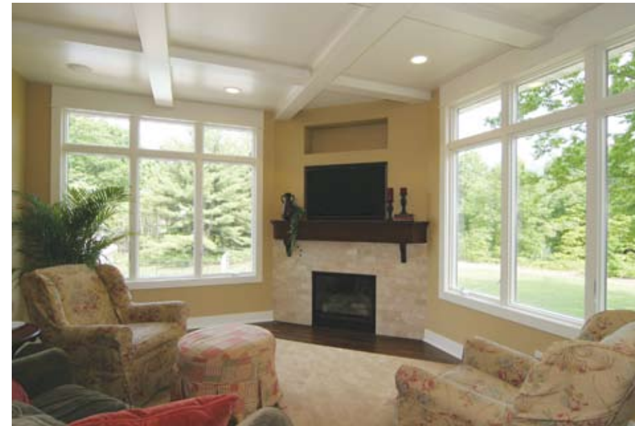
ABOVE LEFT: Fireside seating is everyone's favorite. MIDDLE LEFT: The master bedroom encases the wooded view. BELOW LEFT: This spacious home office provides a beautiful and functional workspace. ABOVE RIGHT: A lower level bath combines creative design with a practicality. BELOW RIGHT: Snappy theatre room seating for 14, with plenty of floor space, for comfortable viewing and relaxing enjoyment.